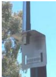
MB-100 Optional mast mount